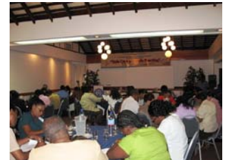
Trinidad and Tobago