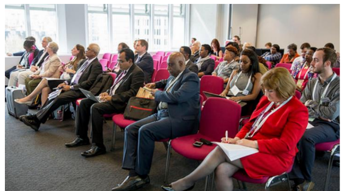
CHPA Symposium on Universal Health Coverage: holding countries to account.

The CNMF participation, sponsored by the Commonwealth Foundation, is gratefully acknowledged.