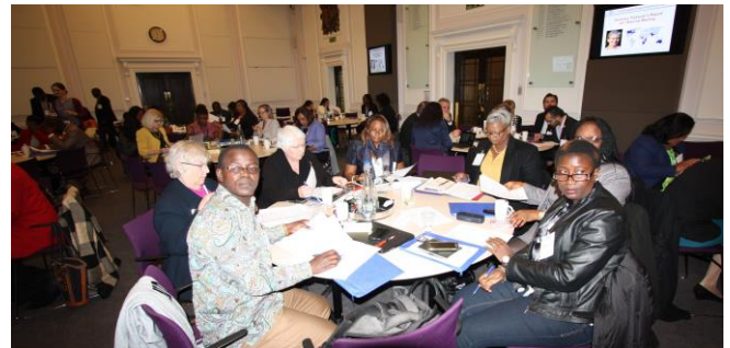
CNMF Biennial March 2016