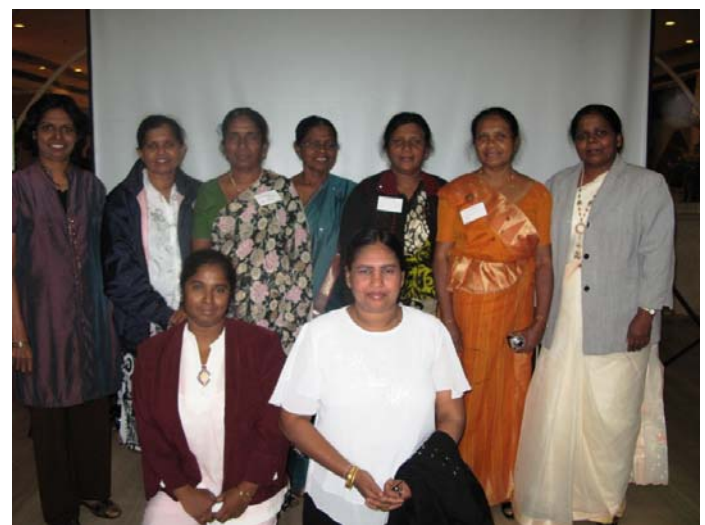
Sri Lanka delegation

The Commonwealth Steering Committee for Nursing and Midwifery held their annual regional workshop in New Delhi India 16-17 February. Among those attending were ten nurses from Sri Lanka. Copies of the presentations are available on the CNF website: http://www.commonwealthnurses.org .