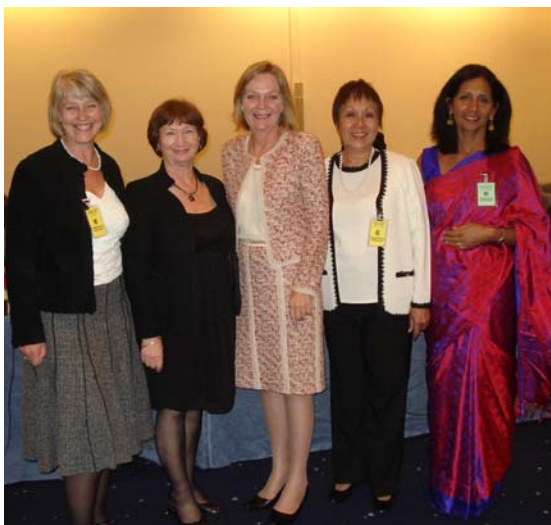
Members of the CHPA with Senator Jan McLucas

The Commonwealth Health Professions Alliance (CHPA) was officially launched at the Commonwealth Health Minister's meeting in Geneva on Sunday 17 May. The CHPA consists of seven Commonwealth health professional associations accredited to the Commonwealth. The CHPA consider that by working together they can more efficiently and effectively represent and support health professionals in Commonwealth countries and promote high standards of care and equity in access to care for people living in Commonwealth countries.