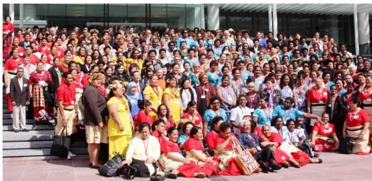
15 th South Pacific Nurses Forum participants