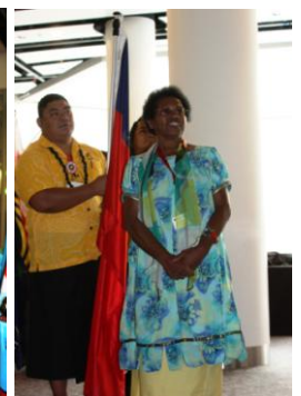
Papua New Guinea