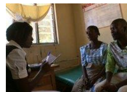
Focused Antenatal Care