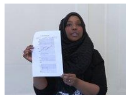
How to use the Partograph