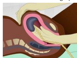
Manual Removal of the Placenta