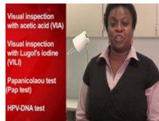
Cervical cancer: Screening and treatment