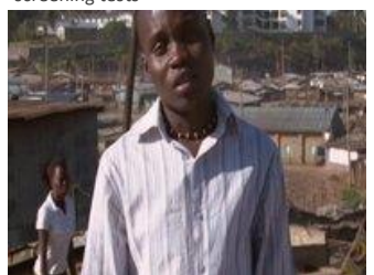
How to plan a pregnancy