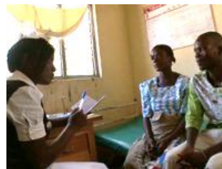
Focused antenatal care

Medical Aid Films produces short educational videos with a focus on improving maternal and child health which can be downloaded free from their website. To see the full range of Medical Aid Films, go to: http://medicalaidfilms.org/ . The CNMF frequently uses Medical Aid Films in our education and training workshops. They are an excellent resource and very well received by nurses and midwives who not only find them useful for their own learning, but useful also for teaching in the community setting.