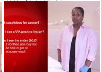
Cervical cancer: How to conduct VIA and screening tests