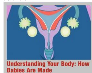
How babies are made