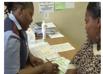
Cervical cancer: understanding prevention Screening and treatment