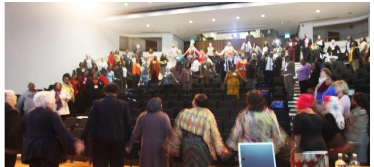
Conference delegates say farewell by joining hands and singing Auld Lang Syne

This was the way participants at the 2 nd Commonwealth Nurses Conference, Nurses and Midwives: agents of change , described the conference held 8-9 March 2014 in London. Two hundred nurses from 26 Commonwealth countries attended the conference which was held at the beautiful and historic Royal College of Physicians. The conference had four themes: maternal and child health; mental health; primary health care; and acute and chronic health care. Papers presented at the conference were of an exceptionally high quality. The papers will be uploaded to the CNMF website. The proposed dates for the 3 rd Commonwealth Nurses Conference which will be held in London are 5-6 March 2016. The conference announcement and call for abstracts will be issued this coming September.