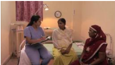
Preparing the birthing room

This film shows the supplies to have ready to prepare for a birth. The intended audience is frontline health workers in the developing world. The film and others from Global Health Media are available from: http://globalhealthmedia.org/newborn/videos/ .