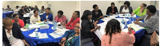
Research and IT

By 2025, nurses will be key advocates as stakeholders in developing and implementing national policies toward achieving optimal health and wellbeing for the people of the Bahamas.