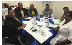
Leadership and governance